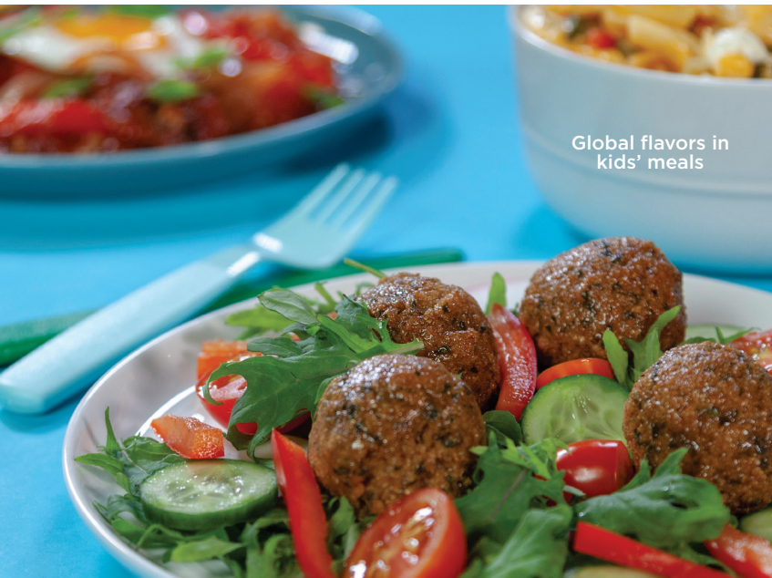
Global flavors in kids' meals

CBD and cannabis-infused food and beverages are among the top trends for 2019, along with zero-waste cooking, globally inspired dishes and vegetable-forward cuisine. American Culinary Federation chefs identified the trends for the National Restaurant Association's What's Hot survey.