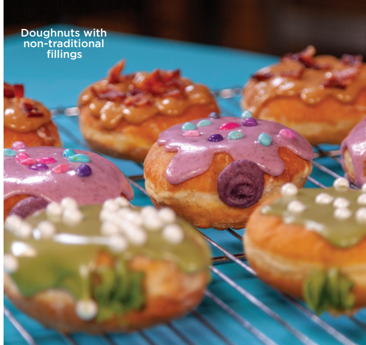
Doughnuts with non-traditional fillings