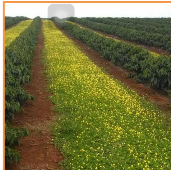
One year after planting with good ground cover - Arachis pinto (miniature peanut)