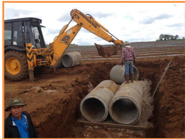
With 3 to 4 meters of rain per year makes drainage important. The water has to go somewhere. 7 to 8 months with heavy rain and 4 months without any rain makes for some interesting opposites.