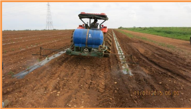
Spraying “amino acid” and other “micro- nutrients” after planting will help with a good plant start. It also can help during frost and any other stress condition.