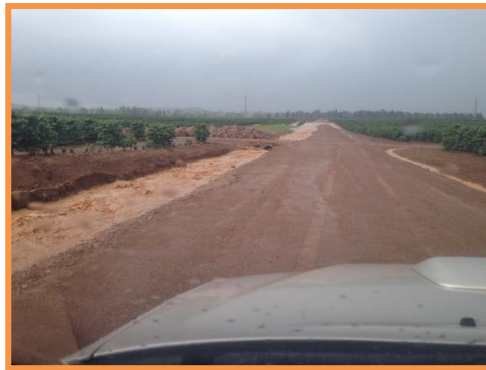
Any low spot will fill with water and kill the coffee. All low spots have to be drained or filled and sloped for drainage. Waterways need to be planted with Bermuda-grass for erosion control. Annual rainfall 3 to 4 meters.