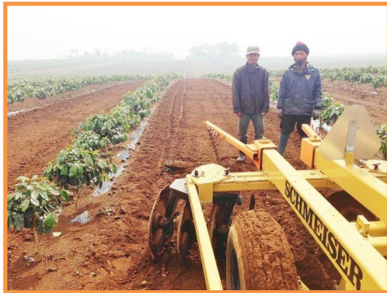
As long as the ground is open the heavy orchard disc is the best tool for weed-control. It is fast and easy to use. Because of the weight, it has hydraulic wheels to lift of the ground.