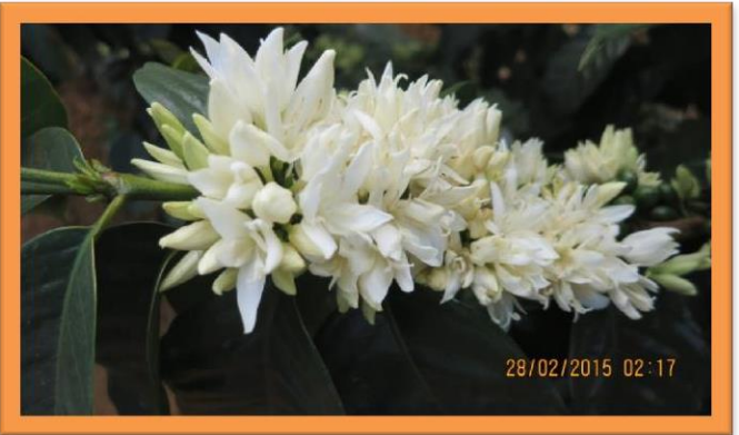
For each node, there are flowers (not always). In this case, there are about 20 to 24 flowers per cluster. There are also leaf buds where new leaves are emerging from.