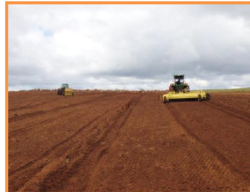
Rocks up to 1.5 feet can be handled with a Rock Rake. Surface rocks are winrowed from two sides and picked up by the Rock Picker.

The rock picker can pick rocks up to 1.5 feet (maybe 2 feet) in diameter. The rocks can only be picked up on the surface and need a harrow (for the smaller rocks) to bring them to the surface.