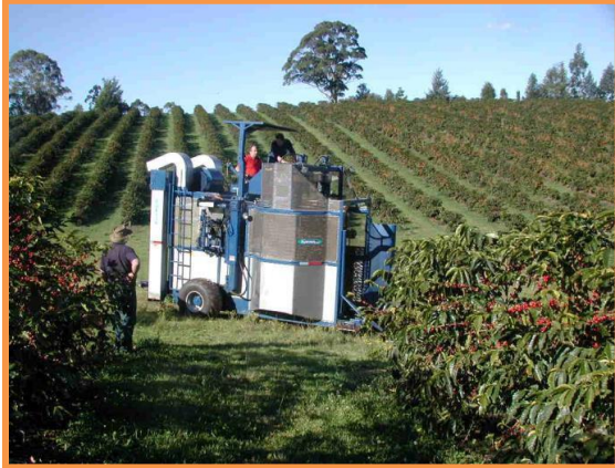
In Queensland Australia a Korvan machine is harvesting coffee. 30% Over Ripe, 60% Ripe and 10% Under Ripe.