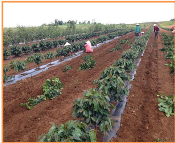
Manual pruning and removal of lower branches at about 1 year.