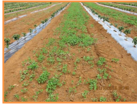
One month after planting. Good growth response. Arachis pinto for ground-cover