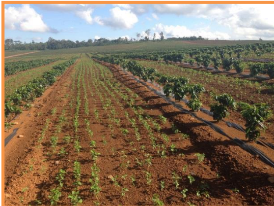
Eight months after planting