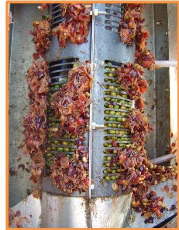
Agromachine "Vertical Green Bean Separator".

Good Green Bean Separation and Over Ripe Separation with flotation are critical to get the best cup results. With today's processing machinery it is possible to remove any immature green to less than 2%. Many people doubt that Specialty Coffee can be produced using harvesting machines.