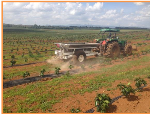
Three months after planting, coffee is growing well. Fertilizing Arachis with spreader.