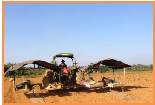
A 3 point platform can help in the early stages of weed-control, especially around the planting hole and close to the side of the plastic.