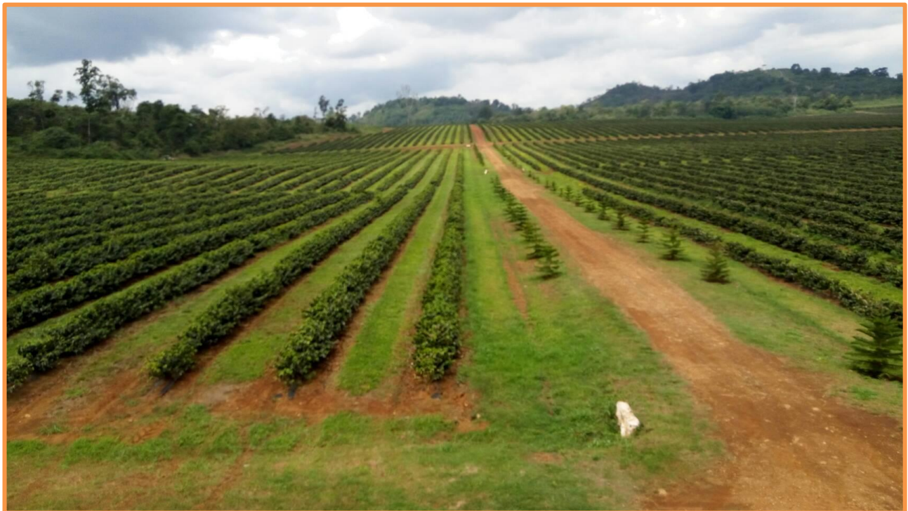
Coffee development 1.2 year after transplanting.