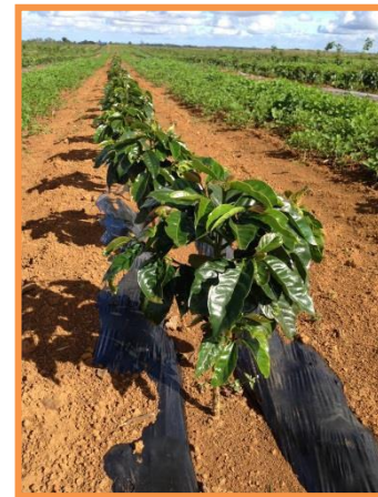
Eight months after planting.