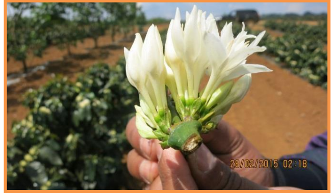
First major flowering at two years of age. About 18 to 24 flowers per cluster.