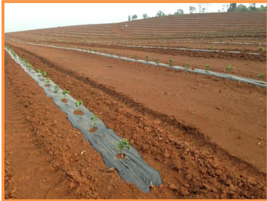
Two weeks after planting, no loss of leaves