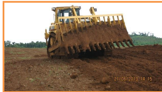
Dozer with rock rake for pushing rocks and leveling of high spots.

Modified steel plates pulled by tractors can handle large and small rocks. Very large rocks need two tractors. Front blades on tractors are a great tool.